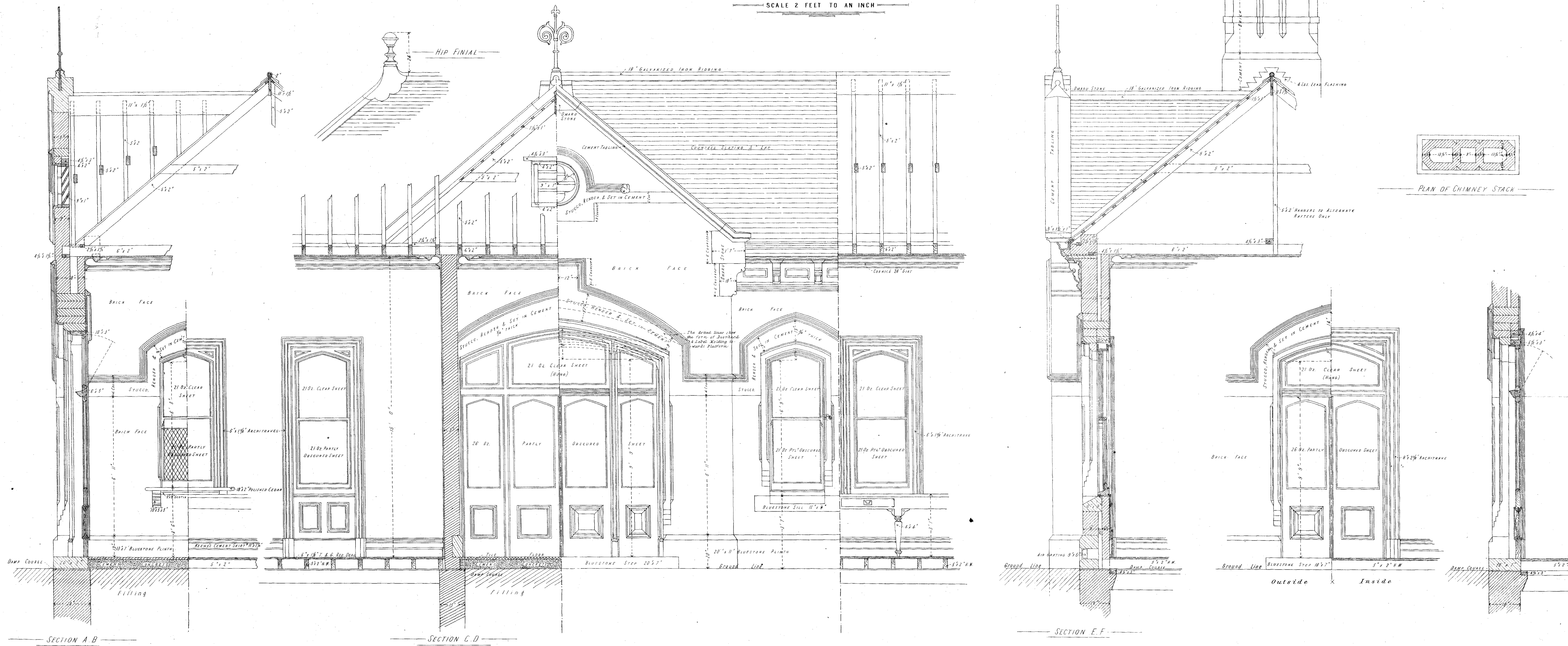
PLAN, SECTIONS & ELEVATIONS OF CENTRAL PART TOWARDS ROAD