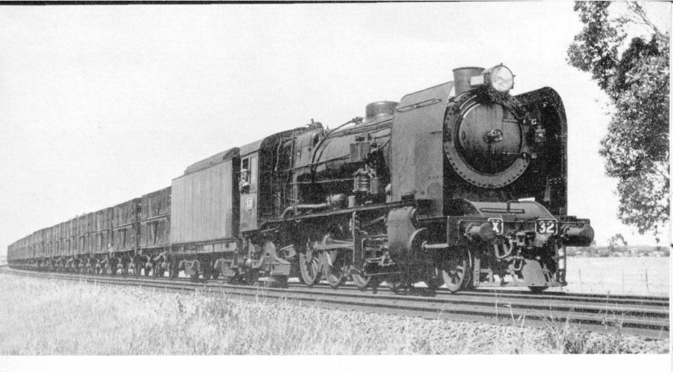
BROWN COAL FIRED ENGINE

Another important and immediate project is main line electrification. The first stage concerns the Gippsland line, between Dandenong and Traralgon. Electrified, regraded and with progressively duplicated track, it will cope with the rapid exploitation of Morwell brown coal, make substantial operational economies and help to reduce the State's demand for New South Wales coal by about sixty thousand tons a year. Electric locomotives to be imported for this line will be suitable for hauling heavier passenger and freight trains faster. New sub-station plant will be ordered, shortly, for this and some of the suburban lines.