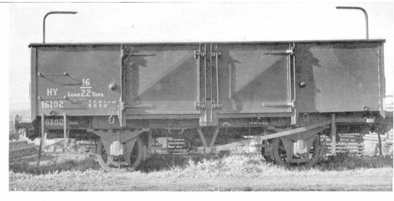
GENERAL PURPOSES TRUCK

Second, money and labour available for such primary material as sleepers and ballast enabled the Railways to recondition a good deal of track: and third, the modernization in design of more than two hundred old engines, at low cost, increased both horse-power and fuel economy, and got more and better work out of them than ever before.