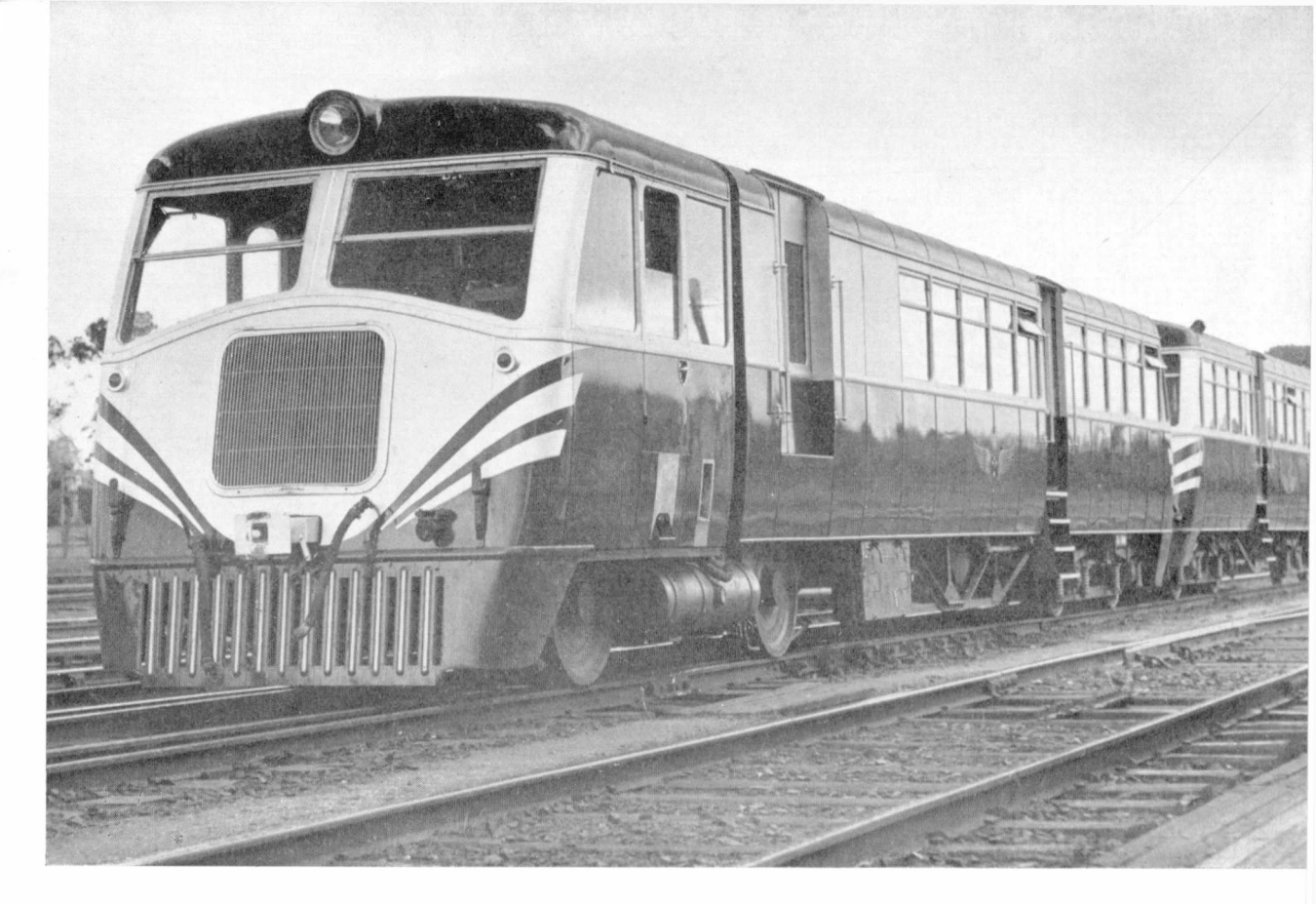
DIESEL RAIL-CAR AND TRAILER

Highly versatile machines, they will speed up express passenger and freight services, and return valuable savings.